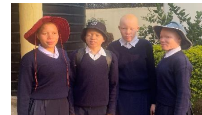
Some of the group who attend a local Secondary school