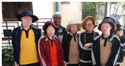
Some of the group who attend Secondary school in Moshi