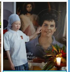
Celebration of St. Carlos Acutis