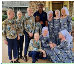
Meeting with the son of Julius Nyerere