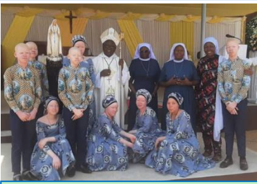
Eucharistic Celebration with the Bishop in Shinyanga