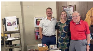
July Mission appeals at SJB- Plymouth and STA- Elkhart Lake, WI