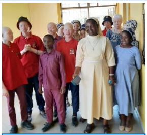
Visit with the Religious Sisters in Musoma