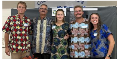
September Mission appeal at Holy Trinity in Newburg, WI