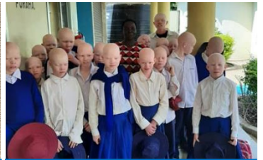
This group attends a boarding Primary school in Musoma