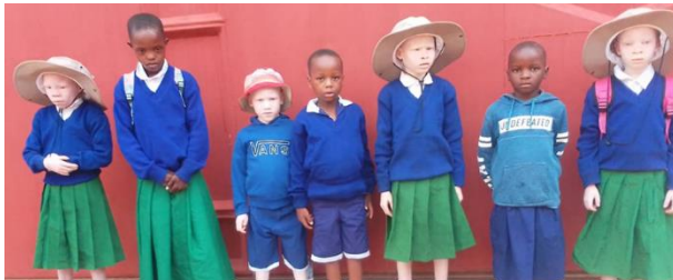
Young kids attend a local Pre-Primary School