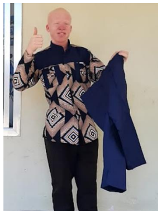
Behebe is learning how to be a Tailor at a program in Musoma