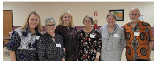
2 nd annual Dining in the Dark Event at SJB in Plymouth, WI sponsored by the ZeruZeru Ministry